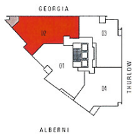
FLOORS 46-47 55-57