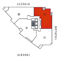
FLOORS 46-47 55-57